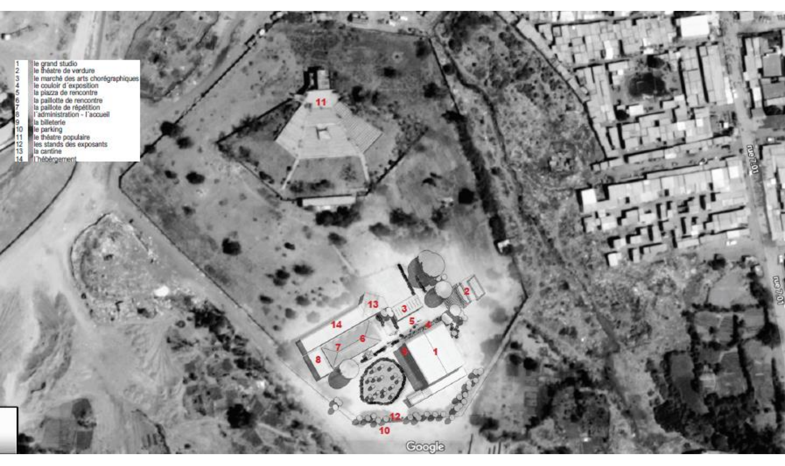
Plan based on google maps by M Solnická from Jakub Cigler Architekti, visualisations of compound for Dialogues de Corps 2018

11 – theatre Populaire located in the plan of the festival Dialogues de Corps 2018